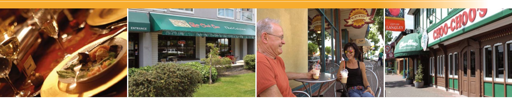
With an affluent — and growing — trade area population, the City of Langley is a great place to run a restaurant.