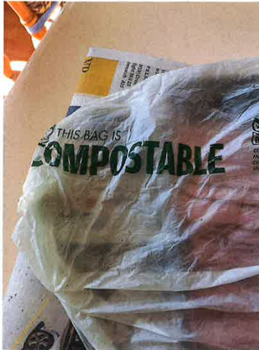
Sent from my iPhone