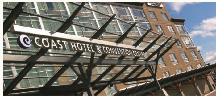
Coast Hotel & Convention Centre