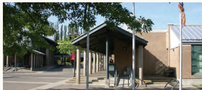
Kwantlen Polytechnic University

Within just 10 square kilometres (4 square miles), the City of Langley contains six established residential neighbourhoods, a natural wetland of regional significance, parkland exceeding 300 acres, high density residential development, a revitalized pedestrian-oriented downtown core, a regional shopping centre and one of the most active industrial and service commercial land bases found in the Lower Mainland.