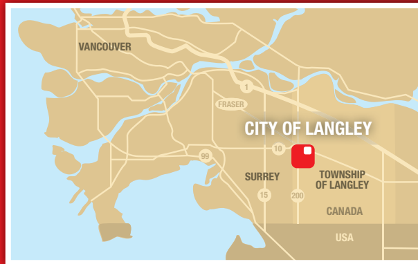
Downtown Langley is located east of 200th Street, along the Fraser Highway.

The Downtown Langley Business Association (DLBA) works to support its member businesses through marketing campaigns, event planning, and other initiatives, including (but not limited to) the "Get Fresh" Façade Improvement Grant Program, McBurney Plaza Summer Series events, street banners, clean streets initiative, and more.