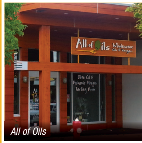
All of Oils

"Downtown Langley is a fantastic place to run a business. We've enjoyed steady success for the last 12 years, increasing by nearly 30% every year. Both the customers and merchants have been very supportive. Downtown Langley is a great place to have a business. I love it here. I wouldn't want to be anywhere else."