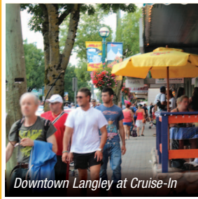
Downtown Langley at Cruise-In