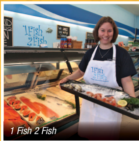
1 Fish 2 Fish