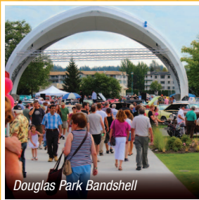
Douglas Park Bandshell