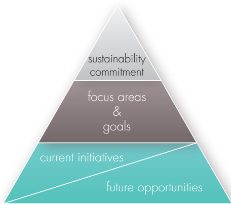
Figure 2. Sustainability Framework Structure

The City's Sustainability Framework has three key components: a 1) sustainability commitment , 2) focus areas and goal statements , and 3) associated current initiatives and future opportunities . The figure below illustrates the Framework structure; followed by an explanation of each component of the Framework.