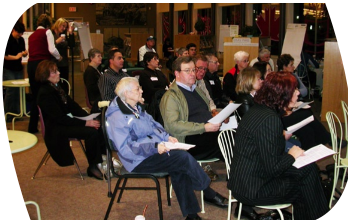
Figure 1. Public Workshop at the Public Library